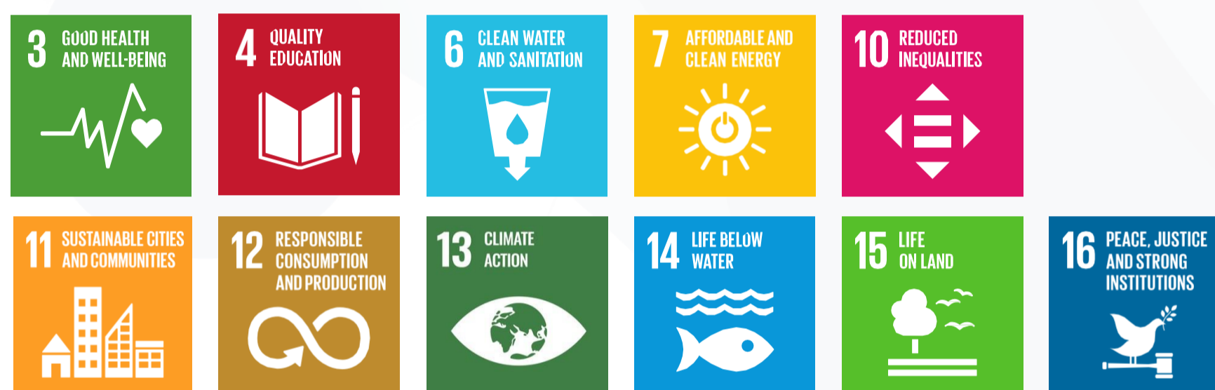
HUC-Social Ideas Challenge SDG